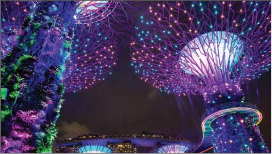
Photo of Singapore.

Language grants are a special priority for the Asia Center. In particular, it is critical that graduate students studying Asia be proficient in multiple Asian languages; to engage deeply with and understand any one country in such an interconnected region, students often must gain fluency in more than one language. For this reason, the Asia Center is committed to ensuring that all graduate students learning a language essential to their course of study, including those working on Southeast Asia, have adequate funding to achieve a high level of proficiency in that language.