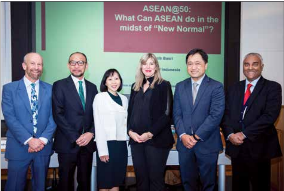
The Asia Center celebrated the 50th anniversary of the founding of the Association of Southeast Asian Nations with its ASEAN@50 Conference in 2017.

In October 2017 the Asia Center organized, under the direction of the Southeast Asia Committee, a full-day conference commemorating the 50th anniversary of the founding of the Association of Southeast Asian Nations (ASEAN). This multi-disciplinary conference featured Southeast Asia scholars and dignitaries and Harvard faculty members in various disciplines and was organized in two panels, one focusing on peace and prosperity and the other on aging populations and noncommunicable diseases. The conference complemented the Center's annual Tsai Lecture featuring the late Dr. Surin Pitsuwan, former Secretary-General of ASEAN, who spoke on past accomplishments and future opportunities for ASEAN.